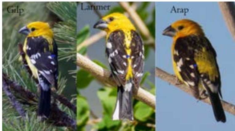
Yellow Grosbeak. 6/4/2025, 7/1/2025, 5/8/2025, Gilpin, Larimer and Arapahoe Counties.

Vermilion Flycatcher Pyrocephalus rubinus (Sheila Webber*; 2025-001; AWR): A breeding plumaged male