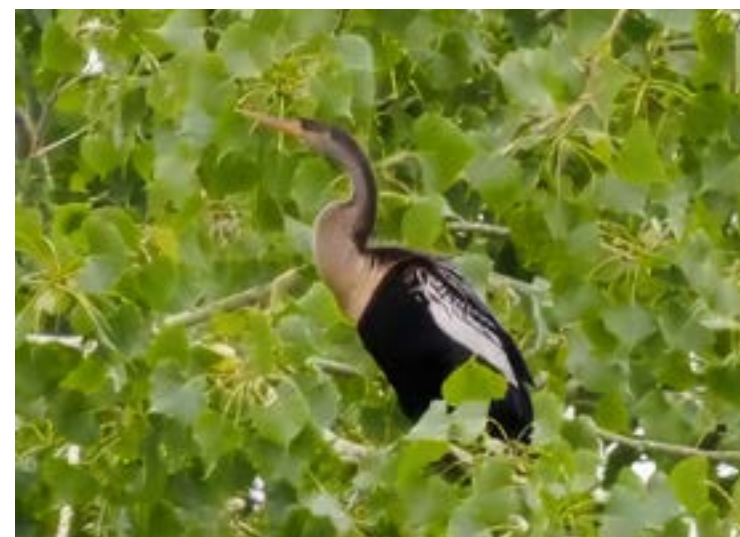
Anhinga. 6/2/2025, Boulder County.