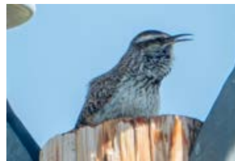
Cactus Wren. 6/14/2025, Las Animas County.