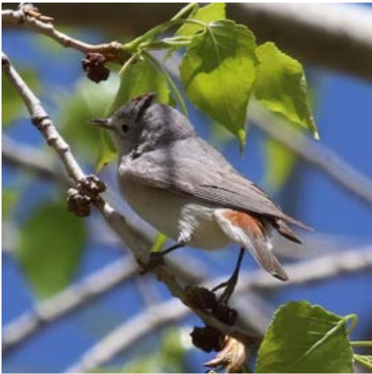
Lucy's Warbler. 4/29/2025, Larimer County.

Street east of Gunbarrel, Boulder , on 2 Jun 2025. This is the fourth record of this species in Colorado, and the first since one was seen flying east of Barr Lake in May 2003. The first two records were of birds collected in the north Denver area in 1927 and 1931. This bird was featured in the Denver Post and on 9News and became something of a celebrity, as it