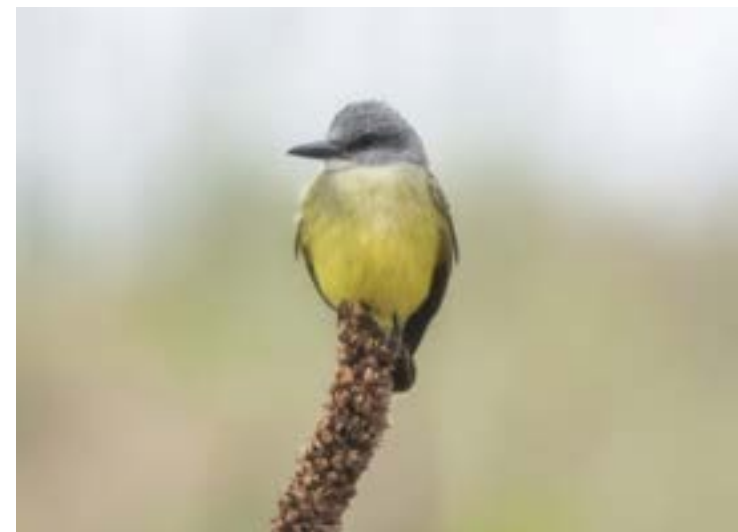
Tropical Kingbird. 6/30/2025, Arapahoe County.

Yellow Grosbeak Pheucticus chrysopheplus (Courtney Rella*, Matt Newport*; 2025-012; 7-0): One was seen at a feeder along the Kiowa-Bennett Road, Arapahoe , on 8 May 2025. This is the third record of this species in Colorado but also see the North Central region below.