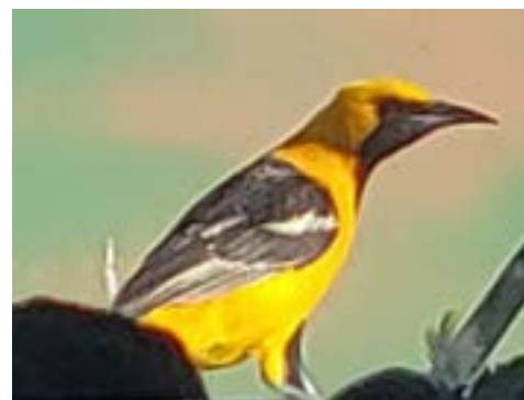
Hooded Oriole. 6/16/2025, Gunnison County.