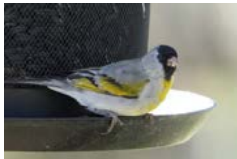
Lawrence's Goldfinch. 4/27/2025, Huerfano County.

Long-tailed Duck Clangula hyemalis (Heather McGregor*; 2023-071; AWR): A beautiful male in full non-breeding plumage wintered on the Colorado River in Glenwood Springs, Garfield , from 9 Dec 2023 through 12 Mar 2024.