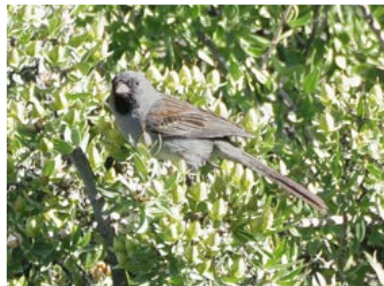
Black-chinned Sparrow. 6/27/2025, Montezuma County.