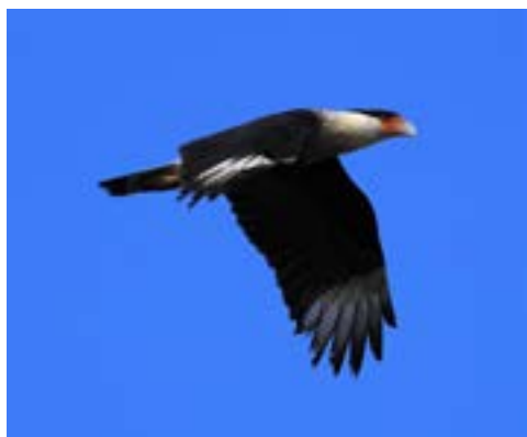
Crested Caracara. 3/12/2025, Pueblo County.