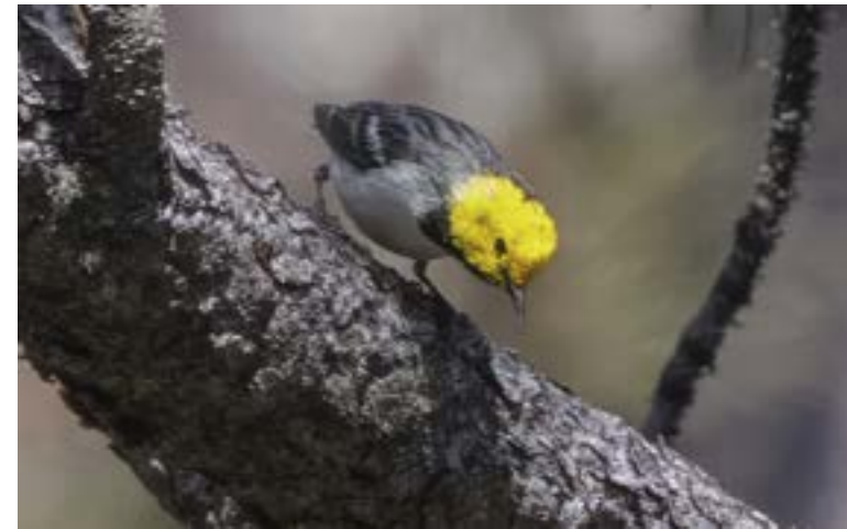
Hermit Warbler. 6/8/2025, Jefferson County.

was seen along Old Apple Valley Road northwest of Lyons, Boulder , on 2 Apr 2025. It stayed around for a few days and was seen by many observers.