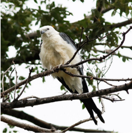
Swallow-tailed Kite, Prowers . 23 August 2017.

Swallow-tailed Kite – Elanoides forficatus (JD 8c , BM 8c ; 2017-050; 7-0): An immature bird was seen for a few days centered on 23 August 2017 in Lamar, Prowers . This is the first time this species has stayed put over a few days, and seen by many birders in Colorado.