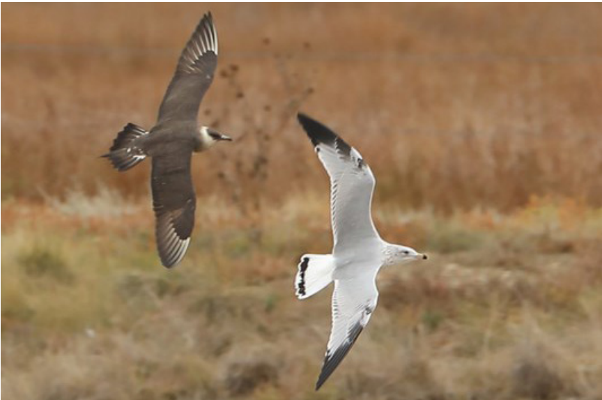
Parasitic Jaeger, Boulder. 6 October 2018.

Parasitic Jaeger – Stercorarius parasiticus ( CW ; 2015-120; 7-0): A juvenile bird was seen on 3 October 2015 at Jackson Res., Morgan . ( KMD § , DF ; 2015-114): An adult was seen on 4 and 11 October 2015 also at Jackson Res., Morgan . ( GW § ; 2016-094; 7-0): A juvenile bird was seen on 15 September 2015 at Cherry Creek SP, Arapahoe . ( BJ § ; 2016-073; 7-0): An immature bird was seen on 9 September 2016 at Chatfield SP, Douglas . ( DD § ; 2016-076; 7-0): Three adults were seen between 17 and 21 September 2016 at Jumbo Res. Logan/Sedgwick . It is extremely unusual to see more than a single jaeger at the same time in Colorado. ( SML § ; 2017-069; 7-0): An immature bird was seen on 7 November 2017 at Windsor Lake, Weld . ( AK § , BP § ; 2018-023; 7-0): Another immature bird was seen on 20 September 2018 at Pueblo Res., Pueblo . ( PB § , SML § ; 2018-022; 7-0): An adult was seen between 6 and 8 October 2018 at Lagerman Res., which is near Niwot, Boulder .