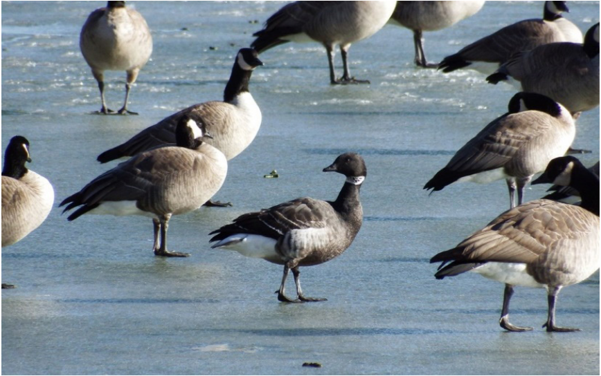
Black Brant, Adams. 13 December 2016.

Tundra Swan – Cygnus columbianus (KD 8 ; 2016-107; 7-0): An adult and immature were seen between 18 December 2016 and 12 January 2017 a few miles northwest of Salida, Chaffee .