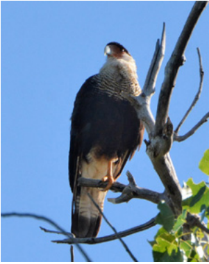
Crested Caracara, Denver. 25 August 2017.