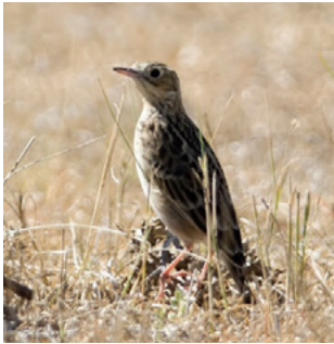
Sprague's Pipit, Larimer. 14 October 2015.

Yellow-bellied Flycatcher – Empidonax flaviventris (BM & ; 2017-058; 7-0): One was banded on 20 September 2017 in the north part of Chico Basin Ranch, El Paso .