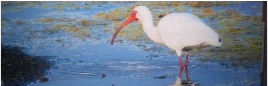
White Ibis, Adams, 18 June 2017.

White Ibis – Eudocimus albus (ZS & , CA, PG & , GM & , MM-L & , DF & ; 2107-044; 7-0): An adult was seen between 18 and 24 June 2017 at Lowell Ponds SWA, which is east of Arvada, Adams .