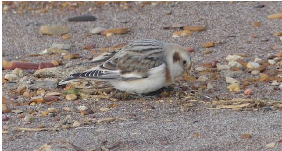
Snow Bunting. 11/18/2021, Crowley County.

Yellow-crowned Night-Heron – Nyctanassa violacea (BP*; 2020-076; 7-0): An adult was seen in Pueblo City Park, Pueblo, from 27 May to 5 Aug 2020. (BP*; 2020-056; 7-0): An immature bird was seen and photographed at Valco Ponds in Pueblo, Pueblo, from 7 to 16 Sep 2020.