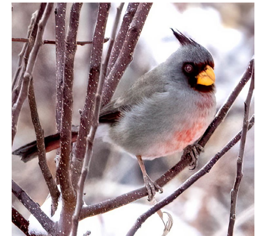
Pyrrhuloxia. 2/12/2022, Denver County.

Connecticut Warbler – Oporornis agilis (BP*; 2017-092; 6-1): An adult was seen at the Thompson Ranch, which is east of Hwy 71 north of Limon, Lincoln, on 3 Oct 2017.