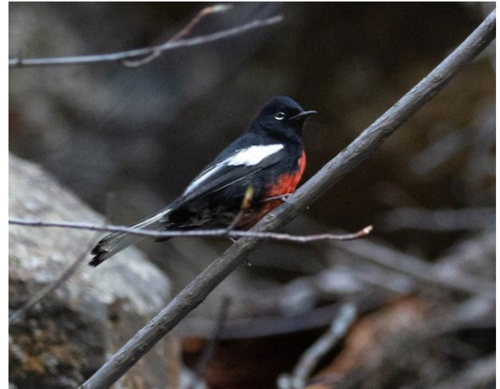
Painted Redstart. 4/29/2021, Ouray County.

Painted Redstart – Myioborus pictus (CU*; 2021-034; 7-0): An adult was seen at Box Canyon Falls Park in Ouray, Ouray, on 29 Apr 2021.