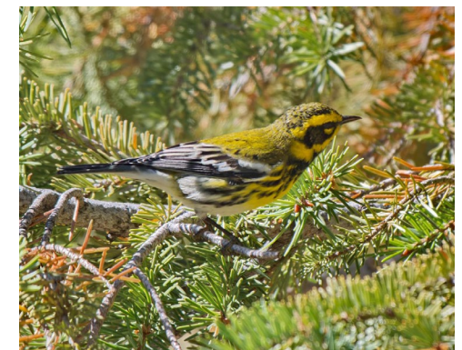
Hybrid Townsend's/Black-throated Green Warbler. 9/20/21, Larimer County.

Cape May Warbler – Setophaga tigrina (SS*; 2021-028; 7-0): A male in breeding plumage was seen at Manitou Lake and Trout Creek, Teller, from 10 to 13 May 2021.