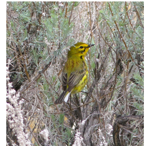
Prairie Warbler. 5/13/2021, El Paso County.

Prairie Warbler – Setophaga discolor (BP*; 2021-033; 7-0): An adult male was photographed in the northern section of Chico Basin Ranch, El Paso, on 13 May 2021.