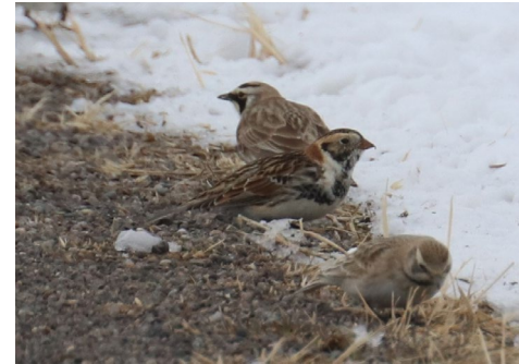
Lapland Longspur. 2/15/2021, San Miguel County.

Miguel, on 15 Feb 2021. This is the first record for San Miguel in the CBRC database.