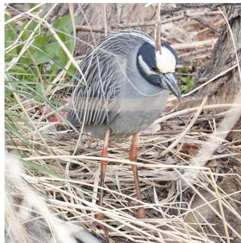
Yellow-crowned Night-Heron. 4/23/2021, Denver County.

An adult was seen in the Denver section of the Bear Creek Greenbelt, Denver, from 16 to 23 Apr 2021 and was seen by a large number of observers.