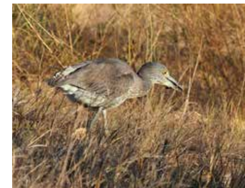
Yellow-crowned Night-Heron. 10/30/2022, Boulder County.

Yellow-crowned Night-Heron – Nyctanassa violacea (PG*; 2022-016; AWR): An immature bird in transitional plumage was seen at Pella Crossing Park near Hygiene, Boulder, on 30 and 31 Oct 2022.