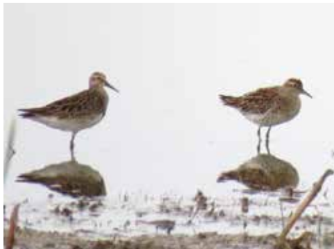
Sharp-tailed Sandpiper. 5/27/2022, Weld County.

Sharp-tailed Sandpiper – Calidris acuminata (DD*; 2022-036; 7-0): An adult in breeding plumage was seen at Stewart's Pond which is just south of La Salle, Weld, on 27 May 2022. This is the 3rd state record and the first in spring. The bird was with three Pectoral Sandpipers, but the rufous cap and white eyering clearly distinguished it from the American species that is most similar to it. The first Colorado record was at Prince Lake #2 east of Boulder in Oct 1975, and the second was at the northwest corner of John Martin Res. in Oct 2000.