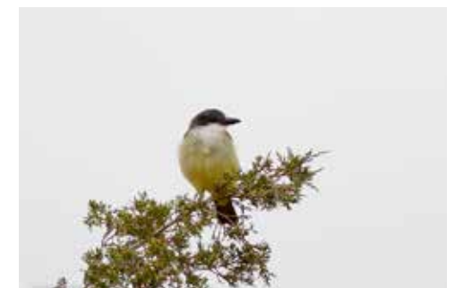
Thick-billed Kingbird, 9/21/2022, Mesa County.

Thick-billed Kingbird – Tyrannus crassirostris (LC*, RO*, BP*; 2022-045; 7-0): An adult was seen just southwest of Highline Lake SP, Mesa, between 21 and 26 Sep 2022. This is the 4th state record of this species in Colorado: the 3rd