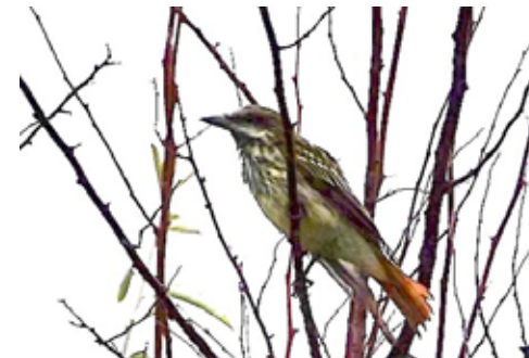
Sulphur-bellied Flycatcher. 9/10/2022, El Paso County.

Sulphur-bellied Flycatcher – Myiodynastes luteiventris (PB*, KK*; 2022-044; 7-0): An adult was seen briefly in the north part of Chico Basin Ranch, El Paso, on 10 Sep 2022. This is the 2nd state record of this species in Colorado: The first was seen at Blue Lake in Bent County in Sep 2002.