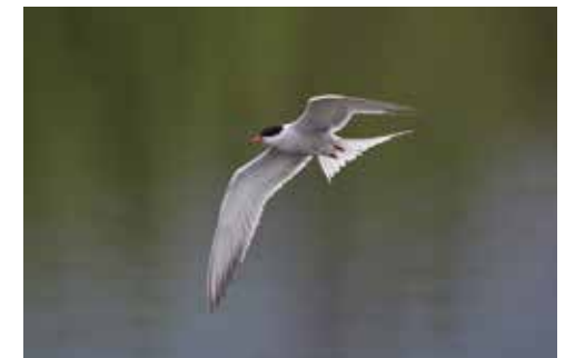
A Common Tern in breeding plumage. While bill and feet color is not always easily apparent, this species has slightly less black in the bill and grayer undersides than a Forster's Tern. Photographed by David Tønnessen in June 2023.