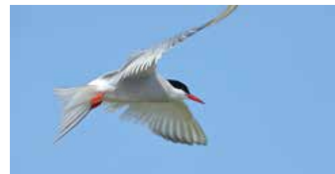
A white cheek and throat area contrasts well with a grayer underside in breeding-plumage Arctic Terns, even without the shadow in this photo enhancing that effect. Photographed by Peter Burke in July 2018.