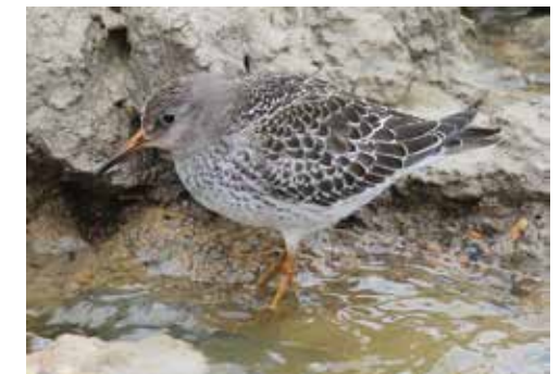
Purple Sandpiper. 10/7/2022, Crowley County.

Purple Sandpiper – Calidris maritima (JK*, BP*; 2022-053; 7-0): An immature bird in transitional plumage was seen and beautifully photographed at Lake Henry, Crowley, on 6 and 7 Oct 2022. This is the 2nd state record: The first was seen at the south end of Lake Dillon in Summit County in Dec 2016.