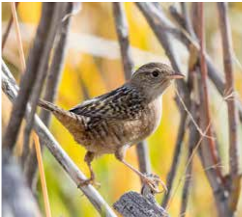
Sedge Wren. 10/23/2022, Boulder County.

Jul 2022. I believe a pair was nesting at this location, which is nearly 200 miles north of its usual breeding locations in Colorado, but the CBRC did not receive any documentation of this.