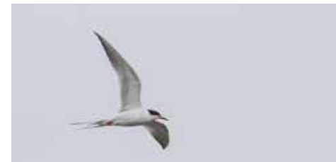
A black cap and dusky-tipped wings are typical of the Sterna terns, while the combined orange bill and legs and whitish belly are typical only of a Forster's Tern in breeding plumage. Photographed by Martina Nordstrand in May 2021.

This article will guide you through identification of the most notorious genus of terns in Colorado, the Sterna terns, and provide a brief overview of the other three expected species also found in the state, to cover a total of six species. Terns of the genus Sterna are the most closely related to each other of these six species, and therefore are often confused, particularly in immature and non-breeding plumages, where all six species can share resemblance.