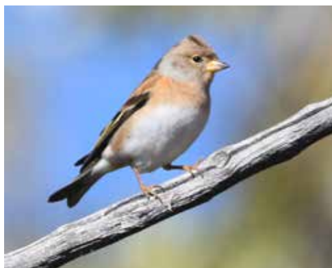
Brambling. 10/31/2022, Prowers County.

Brambling – Fringilla montifringilla (JS*; 2022-051; 7-0): An immature bird was photographed at the Lamar Community College, Prowers, on 31 Oct 2022. This is the 4th state record of this species, and the first since one at Bear Creek Lake Park near Morrison in Nov 2012.