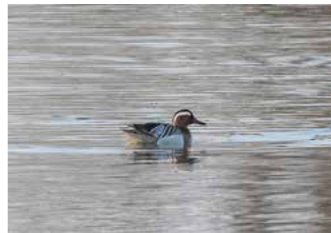
Garganey. 5/8/2022, Larimer County.

Garganey – Spatula querquedula (BT*, PC*; 2022-024; 7-0): An adult male in breeding plumage was seen by many at Boyd Lake State Park in Loveland, Larimer, on 8 May 2022. This is the 3rd state record of this species: the first was at Jackson Res. in Apr 1990 and the second was at Sombrero Marsh in Boulder in Mar 1992.