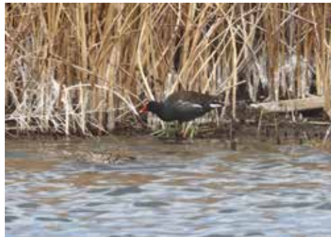
Common Gallinule. 4/19/2022, El Paso County.

Common Gallinule – Gallinula galeata (TB*, MG, BP*, JD*, AD*; 2022-034; 7-0): An adult was documented at Cross Creek Regional Park in north Fountain, El Paso, between 19 and 21 Apr 2022, although it stayed there considerably longer.