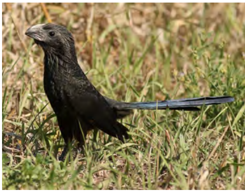
Groove-billed Ani. 10/10/2024, Jefferson County.