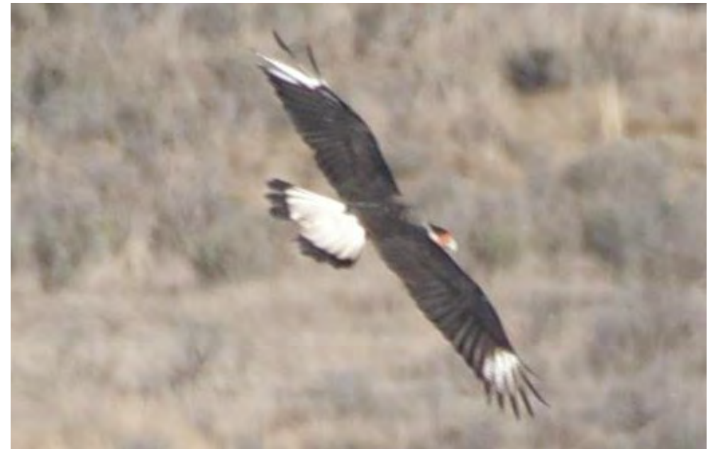
Crested Caracara. 12/5/2024, Montezuma County.

Crested Caracara – Caracara plancus (Paul Morey*, Coen Dexter*; 2024-044; 7-0): An adult was seen near Sleeping