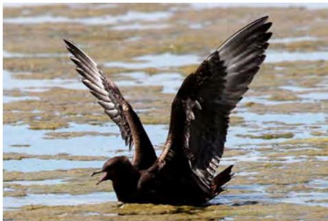
Parasitic Jaeger. 8/28/2024, Alamosa County.

Parasitic Jaeger – Stercorarius parasiticus (John Rawinski*; 2024-041; 7-0): Another very confiding bird was a juvenile at Blanca Wetlands, Alamosa , on 28 Aug 2024.