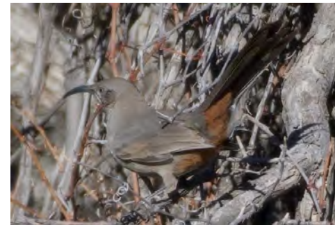
Crissal Thrasher. 11/30/2024, Baca County.