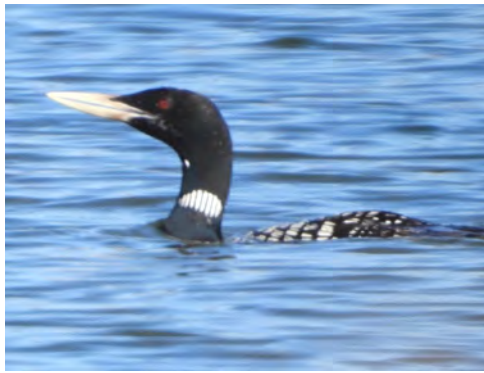
Yellow-billed Loon. 10/4/2024, Park County.