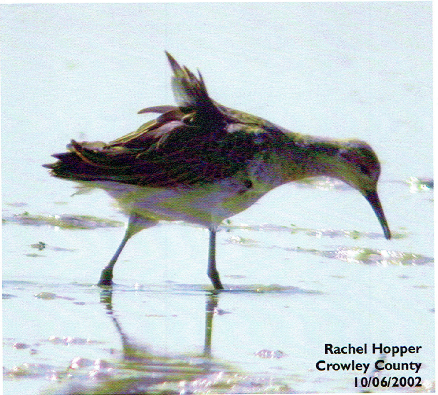
Rachel Hopper Crowley County 10/06/2002