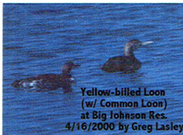
Yellow-billed Loon (w/ Common Loon) at Big Johnson Res. 4/16/2000 by Greg Lasley