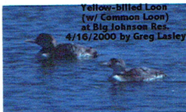
Yellow-billed Loon (w/ Common Loon) at Big Johnson Res. 4/16/2000 by Greg Lasley