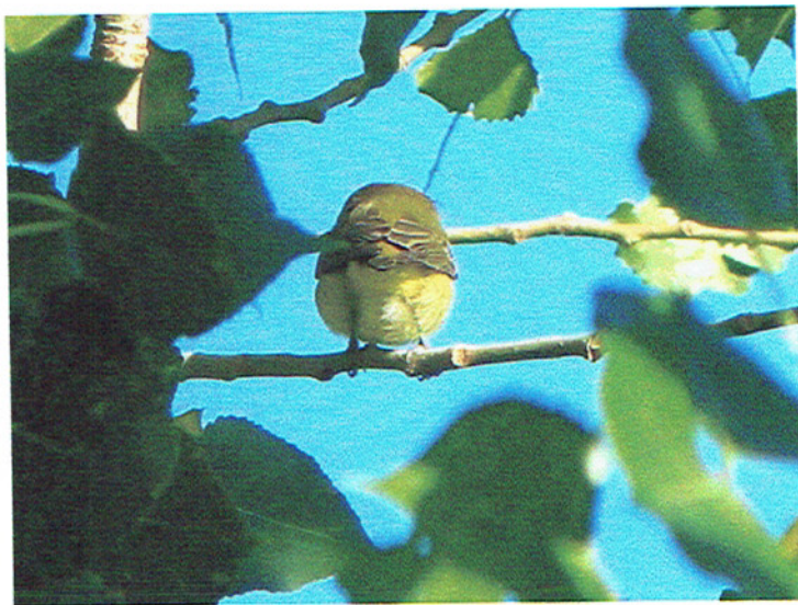
Philadelphia Vireo, Barr Lake, Adams Co. 8-29-03