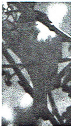
White-eyed Vireo Chatfield State Park 5/24/98