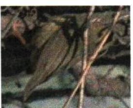
Worm-eating Warbler Lamar Community College 5/3/98 1998-133