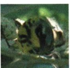
Magnolia Warbler Crow Valley CG 5/23/98