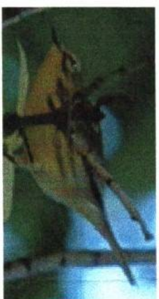
Prairie Warbler Fountain Creek 9/5/98 1998-126