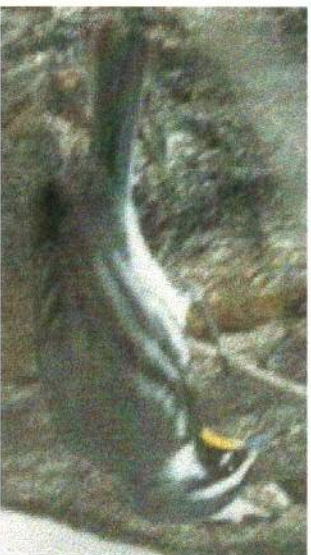
Yellow-throated Warbler Ft. Lyons (16th & JJ) 5/16/98 1998-124