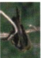
Scarlet Tanager Ft. Lyons 5/9/98 1998- 1004 161